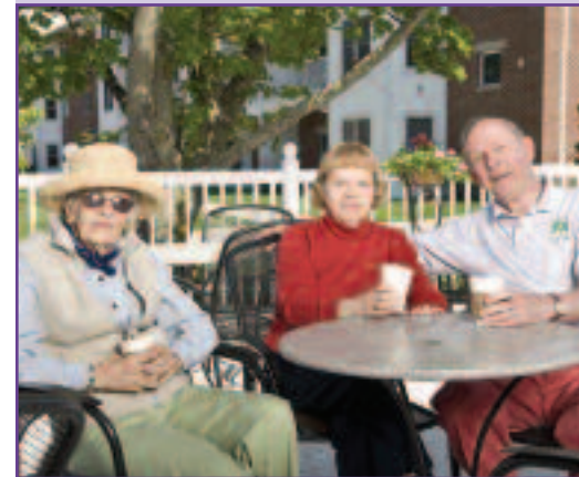
Jazzman's Cafe deck is an inviting spot to share time with old friends and new acquaintances.

Members of Elim Park's Wait List have many opportunities to feel welcomed into our community as they wait for an apartment to become available. As of August 1, however, their waiting experience will be greatly enhanced as they will be offered membership opportunities in the Wellness Center programs!