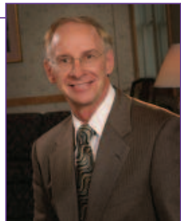
Across the Generations

Cheshire's Not-For-Profit Nationally Accredited Continuing Care Retirement Community Summer 2008