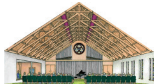
Artist's conception of the Grand Hall of Bethel Place